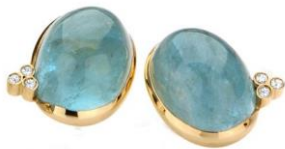
Earrings in 18k gold with aquamarine and diamonds,

1. Give a printed outfit with aquamarine a same-colored jewel to make the pale blue pop.