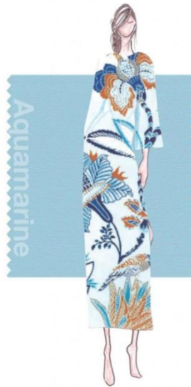
Garment by Banjan, sketch by Pantone

2. Play up the cool hues in an aquamarine ensemble with a silver-tone jewel.