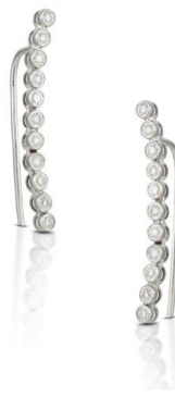
Ear climbers in 18k gold with 0.35 ct. t.w. diamonds, $2,700; Doves by Doron Paloma

2. Play up the cool hues in an aquamarine ensemble with a silver-tone jewel.