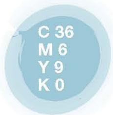
Aquamarine PANTONE 14-4313

The Pantone Spring 2015 Fashion Color Report serves as an overview of designers' color choices in new clothing collections. The colors are important for jewelers to know so they can help customers successfully color-block accessories. Here are five ways to color-block with Pantone's Aquamarine.