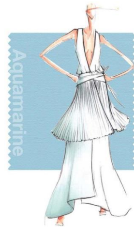
Outfit by BCBG Max Azria, sketch by Pantone

3. Pair a darker blue jewel with aquamarine for a tone-on-tone color effect.