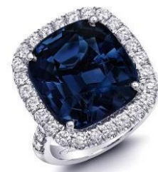
Ring in platinum with 14.27 ct. cushion-shape blue spinel with 1.04 cts. t.w. diamonds, $41,450; Coast Diamond

3. Pair a darker blue jewel with aquamarine for a tone-on-tone color effect.