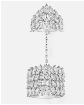
Ring by Messika Paris

Minimalism goes well with the search of harmony in the fast changing economy. This Breezy Lightness theme is also applied in jewelry, with diamonds stealing the limelight of this theme along with micro-links and pearls.