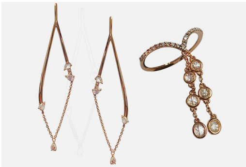
Earrings and ring by Leaderline

green pearls are the most commonly used. Grey and yellow pearls are also evident and often match the metal; grey pearls with white gold, yellow pearls with yellow gold. This delicate and sophisticated approach to pearls makes them wearable all year round and for any occasion.