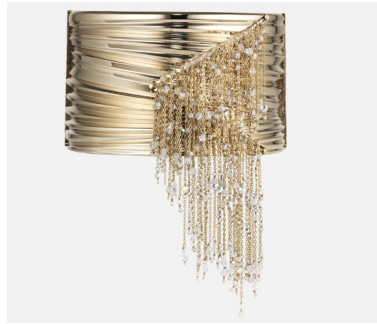
Bracelet by Eden Diodati. As seen in Trendbook 2018+

The Breezy Lightness jewellery silhouettes range from being very rigid to super soft. Necklaces come in both closed and open collar forms, as well as delicate chain link lariats. The rigidity of the open collar necklaces is contrasted by micro chains that come in single and multiple rows and hang from both ends of the opening. The bangles and chain link bracelets are thin and delicate and are made for layering and stacking. Earrings are usually long and in contemporary styles like front-and-back or a combination of drop earrings and ear climbers. Rings are, just like the bracelets, made for stacking. They also come in the form of silhouettes where a regular ring and a midi ring, or multiple finger rings, are linked together by thin chains.