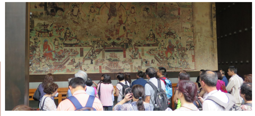
導賞員逐一向參加者介紹寺院的建築物。 Free tour guide provided by the Monastery.