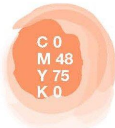
Tangerine PANTONE 15-1247

The Pantone Spring 2015 Fashion Color Report serves as an overview of designers' color choices in new clothing collections. The colors are important for jewelers to know so they can help customers successfully color-block accessories. Here are five ways to color-block with Pantone's Tangerine.