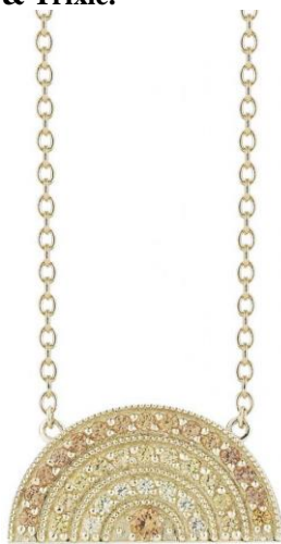
Small Rainbow necklace in 18k gold with 0.1897 yellow sapphires, $1,760; Andrea Fohrman

2. Dress Tangerine-colored clothes with a yellow jewel for a vintage effect, like design house Alice & Trixie.