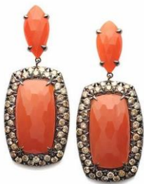
Earrings in 18k gold with 55 cts. t.w. carnelian and 5.6 cts. t.w. diamonds, $15,185; Vancox