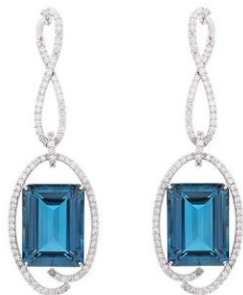
Florere earrings in 18k gold with 50.66 cts. t.w. London blue topaz and 1.968 cts. t.w. diamonds, $11,110; Vianna

1. Pair Tangerine attire with a deep blue-colored jewel for floral market-inspired effect, like clothing designer Trina Turk.