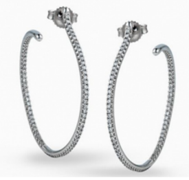
Twisted hoops in white gold with diamonds, $3,300; Simon G.