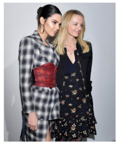
Kendall Jenner in hoops this month

So now's the time to take stock (literally) of the hoops you have in-store and augment your basic selection with a few of the many creative takes on the classic hoop style.